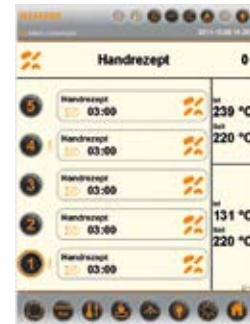
// WP NAVIGO II PROFICONTROL plus