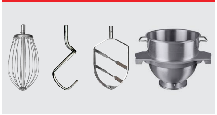
Whip, hook, beater and bowl 40/20 liter in stainless steel.