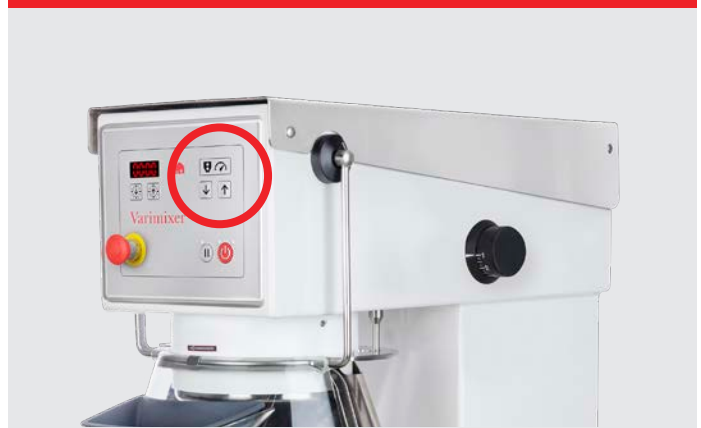
VL-1S – Automatic speed regulation and automatic bowl lowering