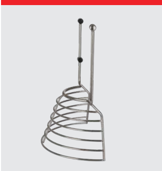
Stainless steel grid guard. Not CE-certified