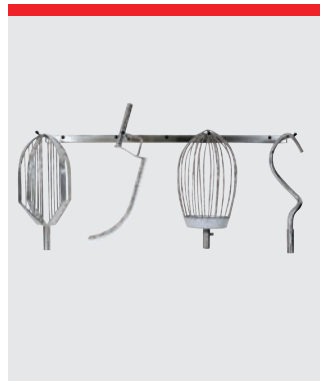
Tool rack, 91 cm