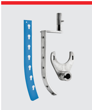
Automatic scraper, stainless steel. 40L and 40/20L.