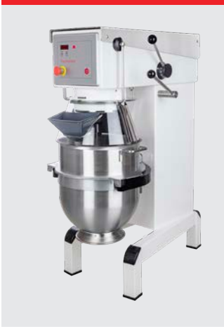
White, powder coated