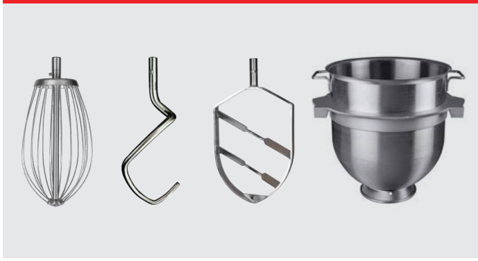
Whip, hook, beater and bowl 40 liter in stainless steel.