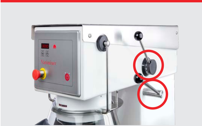
VL-1 – Manual speed regulation and manual bowl lowering