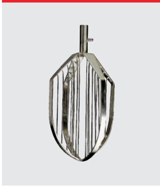
Wing whip, stainless steel