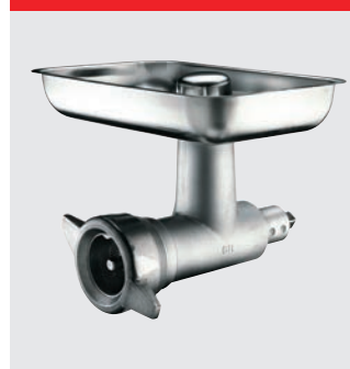
Meat mincer, 82 mm