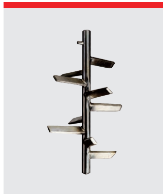
Powder mixer, stainless steel