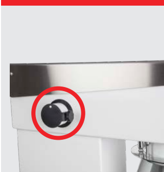
Attachment drive for meat mincer and vegetable cutter