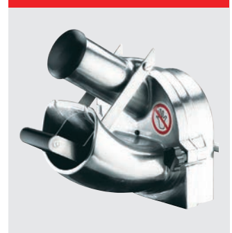
Vegetable cutter GR20