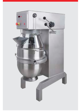
Marine version, stainless steel