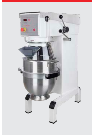
Pizza version, white, powder coated