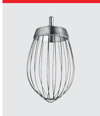
Whip with thinner wires, stainless steel