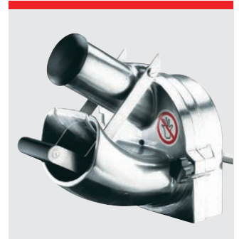
Vegetable cutter GR20