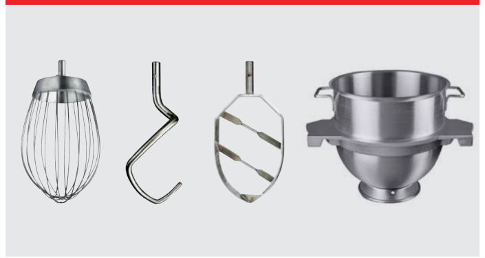
Whip, hook, beater and bowl 60/30 liter in stainless steel.