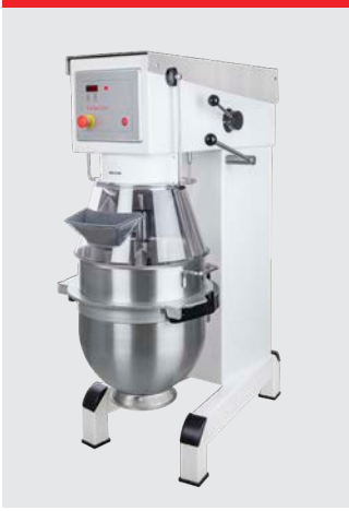
White, powder coated