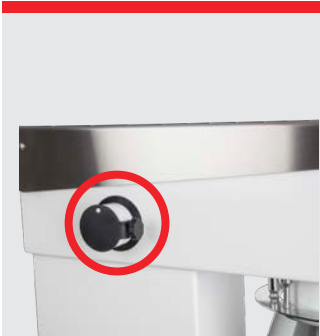
Attachment drive for meat mincer and vegetable cutter