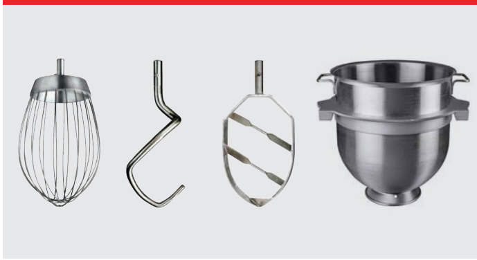
Whip, hook, beater and bowl 60 liter in stainless steel.