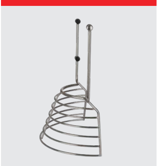
Stainless steel grid guard. Not CE-certified