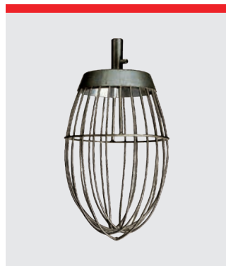
Whip with reinforcement