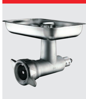
Meat mincer, 82 mm