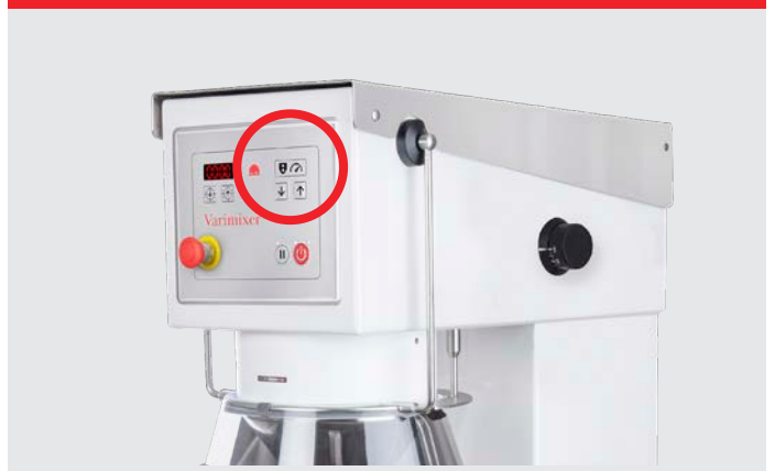
VL-1S – Automatic speed regulation and automatic bowl lowering