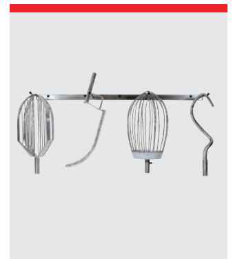
Tool rack, 127 cm